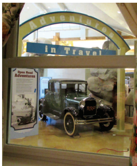
1929 Model A Ford

exhibits with valuable and interesting artifacts that are not part of the Sierra theme; and presenting the stories of the logging, lumber making, ice making, charcoal and iron smelting industries that the Washoe and Chinese were also involved with.