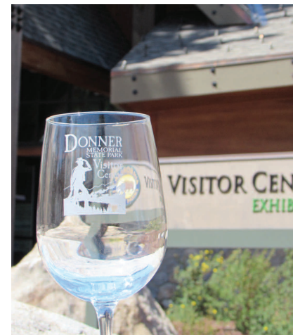
Etched Donner Visitors Center Souvenir Wine Glass