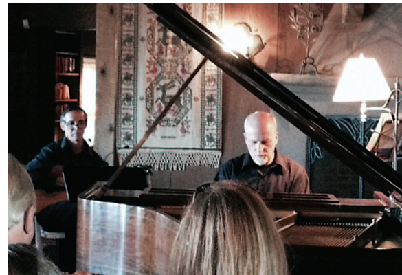
"Music Concert at Vikingsholm"