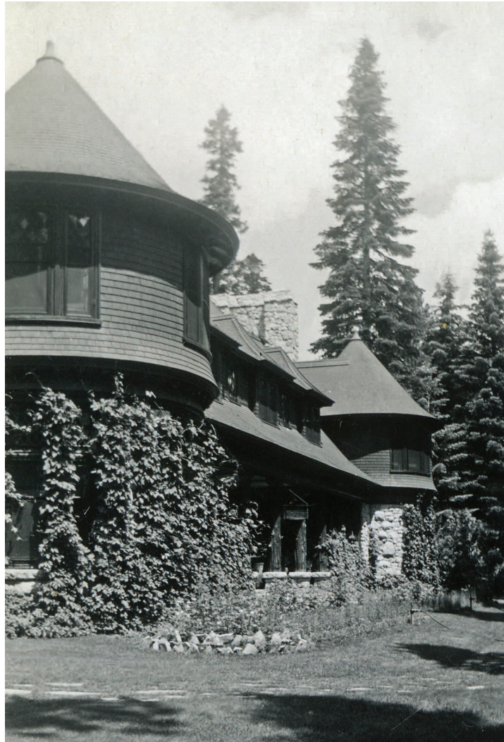
The Pine Lodge at Sugar Pine Point State Park - circa 1940

At Vikingsholm, the report focus involves the area surrounding the house, including the lakeside meadows and planting beds in the courtyard. At Pine Lodge, the areas addressed are the borders around the main house, the “fish pond” planter by the gazebo, the rock edged garden in the lower lawn by the shore of Lake Tahoe, the Children’s House, Tennis Court, Kitchen Garden and the Tank House next to the Visitor Center.