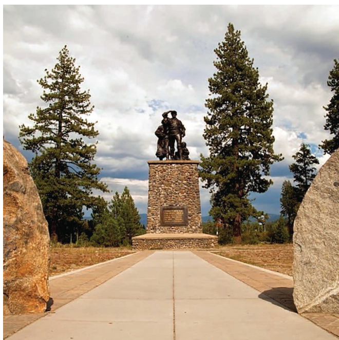
The Pioneer Monument at Donner Memorial State Park

It represents the beginning of the modern era in California.