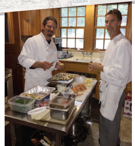
Evening Soirée. This could be your next dinner party inside the Hellman-Ehrman Mansion