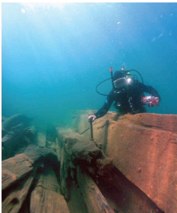
Underwater Archeology Team in Emerald Bay

I would like to build a Sierra Archaeological Site Stewardship Program where trained volunteers work with me to protect archaeological and historical resources by regularly visiting sites and recording changes. We have close to