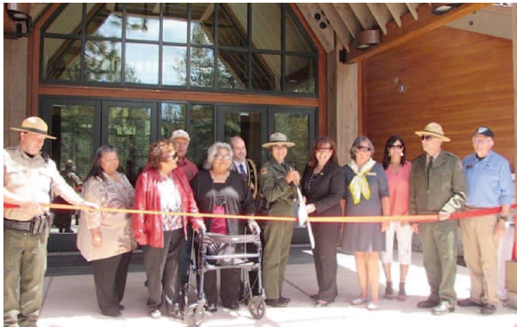
Dedication of the new Visitor Center at Donner Memorial State Park on June 5

A Self-Guided Tour OF THE Hellman-Ehrman Estate Ed Z'berg Sugar Pine Point STATE PARK