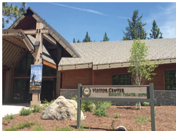
We are so proud of the new Visitor Center at Donner Memorial State Park. Be sure to stop by the expanded store featuring unique gifts and our large book selection. SSPF members receive a 10% discount!

Many upcoming projects are in the works. The park maintenance team is repairing and upgrading the nature trail; it will reopen soon. A new film on the history of the Chinese in the Sierra Nevada will soon be ready for showings at Rock Theater.