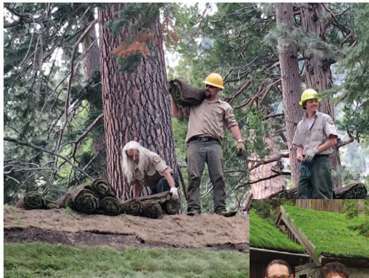
State Park Restoration Crew hard at work on the sod roof.

Below: Our board, staff and volunteers work together to complete critical projects such as restoration of the Vikingsholm sod roof.