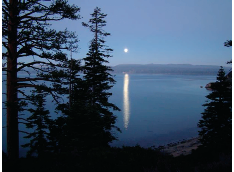
Full Moon On Lake Tahoe