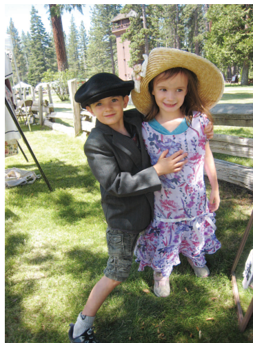
Puttin' On The Ritz at Living History Day

Plan to join us in July 28, 2012 for a family fun filled event.