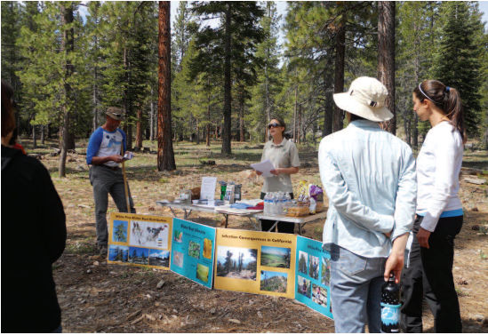
Sierra State Parks Foundation attended Truckee Community Planting Day, hosted by the Sugar Pine Foundation.

transplant program at an internal level, our foundation would like to explore the possibility of organizing a planting day in the Lake Sector parks that would involve community participants as well. For more information on Community Planting schedules, visit the Sugar Pine Foundation at www.sugarpinefoundation.com .